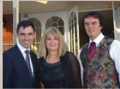
Heidi & Jim with the then Minister for Tourism 2010, Tim Holding at Freeman on Ford

It has seven bedrooms all with ensuites and under cover on site parking. It boasts 2 lounges and award winning landscaped gardens with lap pool and outdoor spa. It has four Victorian rooms upstairs and three bedrooms downstairs decorated in an Art Deco theme. While you retreat to a time gone by, you will not be denied the luxuries of modern life and all the facilities expected in a 5 STAR venue.